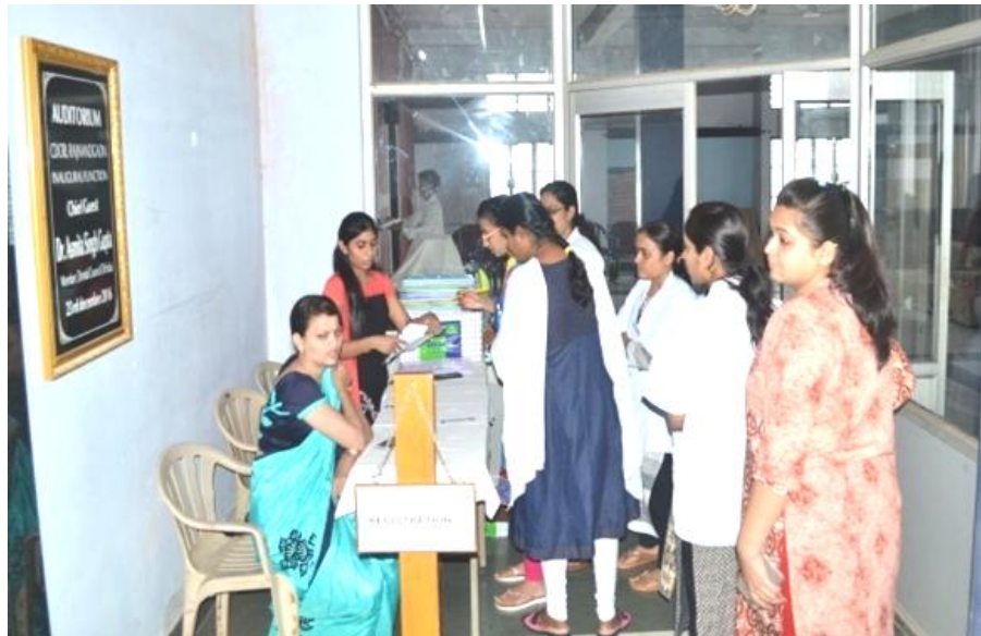
Registration area students