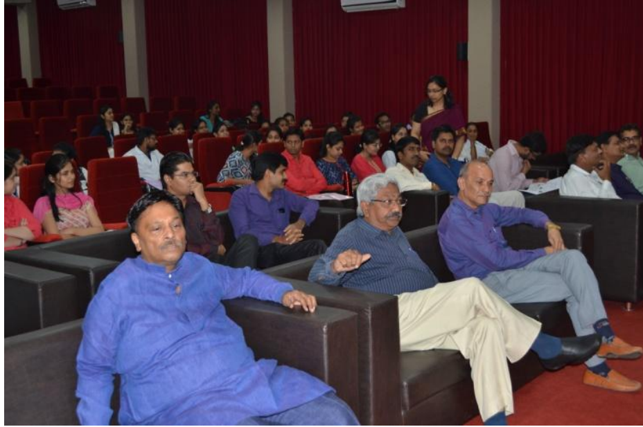
Board Of Directors, staffs and post graduate students