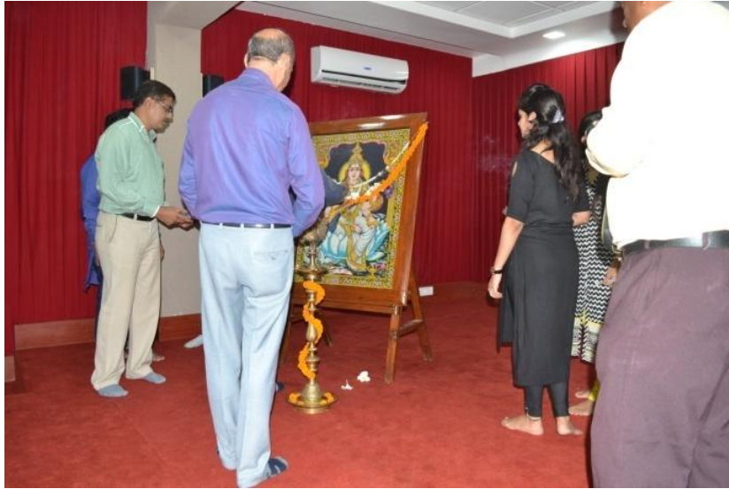
Lightening of Lamp by Board of Directors.